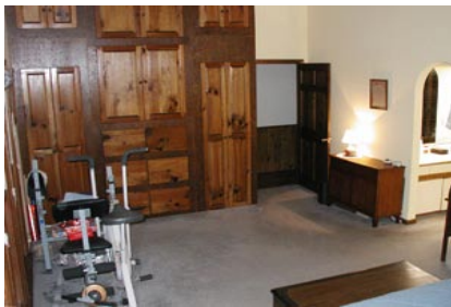
MASTER BEDROOM WITH DOUBLE SINKS TO THE RIGHT AND BUILT IN CABINETS