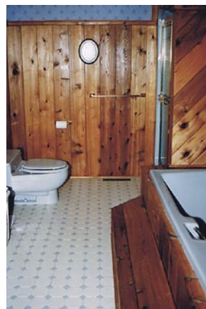
MASTER BATH SHOWER AND JACUZZI TUB