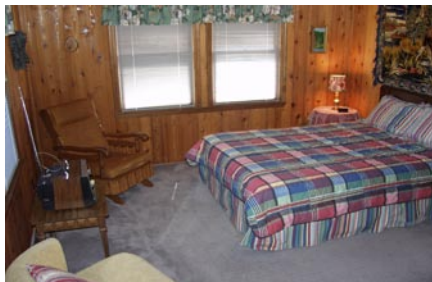
UPSTAIRS BEDROOM NUMBER 1