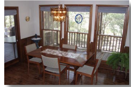
OPEN DINING AREA WITH WIDE PLANK PINE FLOORS