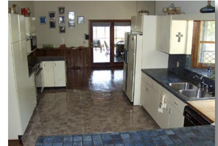
KITCHEN WITH TILE COUNTER TOPS AND NEW FLOORING