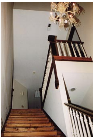
STAIRWELL TO THIRD FLOOR WITH CHANDELIER