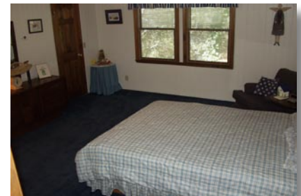
UPSTAIRS BEDROOM NUMBER 2