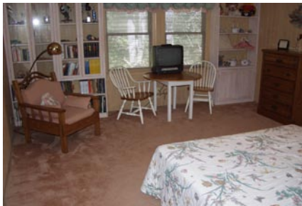
UPSTAIRS BEDROOM NUMBER 3