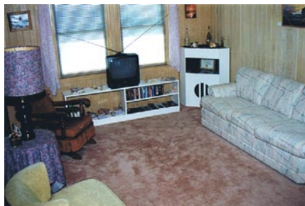
UPSTAIRS BEDROOM NUMBER 4 OR SITTING ROOM