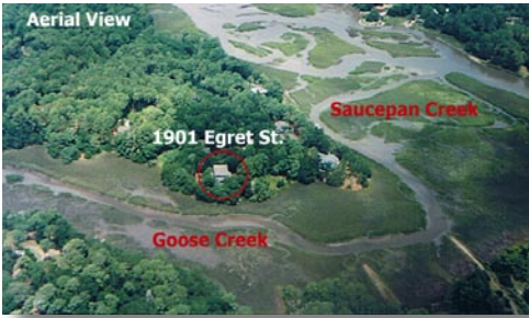
AERIAL VIEW OF HOME ON GOOSE CREEK