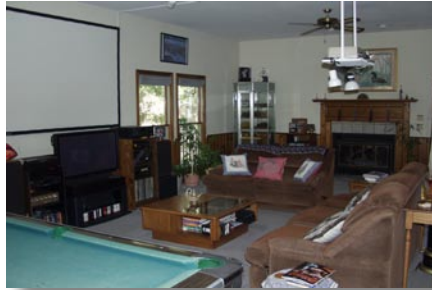
LARGE, OPEN LIVING ROOM WITH 10' CEILINGS